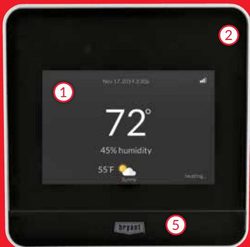
Preferred™ Housewise™ Thermostat

From basic setup and programming to monitoring and tracking energy use, the Bryant® Housewise™ thermostat puts you squarely in charge. And with Wi-Fi® connectivity, you can control it from around the home or anywhere in the internet-connected world.